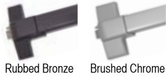
Rubbed Bronze Brushed Chrome